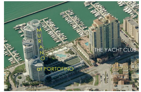
Built in 2002 - 189 units - 37 floors

Murano at Portofino Condominium Association 305-531-4399