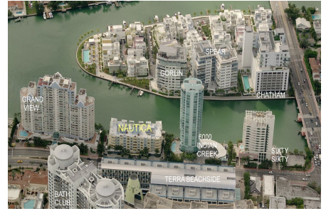
Built in 2004 - 33 units - 6 floors