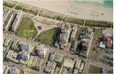
Built in 2003 - 48 units - 8 floors

Ocean Place Condo Association 225 Collins Av: (305) 535-0997 226 Ocean Dr: (305) 538-1234