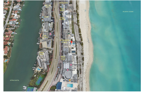
Built in 1967 - 297 units - 18 floors

Oceanside Plaza Condominium 5555 Collins Avenue, Miami Beach, FL 33140 Office (305)-866-7617 Front Desk (305)-864-4718 Fax (305)-866-7619 https://www.oceansideplazacondominium.com/Page/2