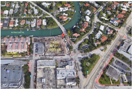
Built in 2016 - 43 units - 5 floors

Palau Sunset Harbour 1201 20th St Miami Beach, FL 33139 (305) 203-1081