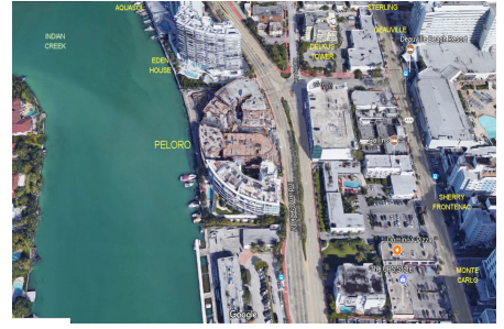
Built in 2016 - 114 units - 6 floors

Peloro Address: 1653 Collins Ave, Miami Beach, FL 33139, Phone: +1 786-383-1553 http://www.sflamgt.com/peloro/