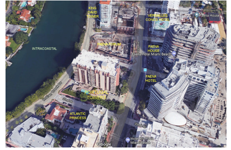
Built in 1982 - 95 units - 12 floors

Portugal Tower Condominium Address: 3200 Collins Ave, Miami Beach, FL 33140 Phone: +1 305-673-6259