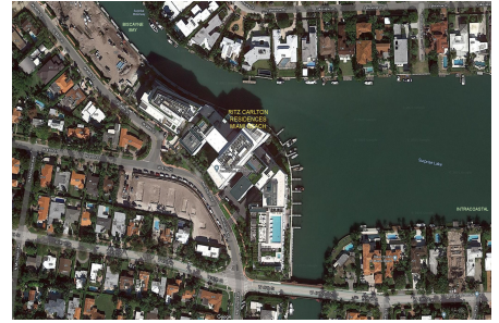
Built in 2019 - 126 units - 9 floors

https://www.ritzcarlton.com/en/residences/miami-beach