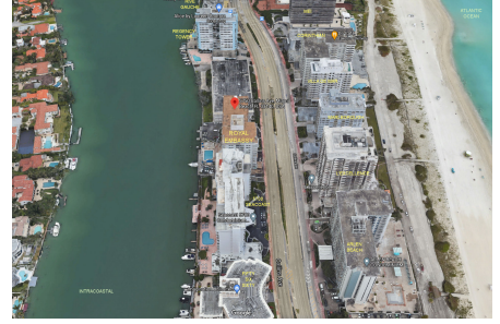
Built in 1968 - 130 units - 17 floors

Royal Embassy Condominium Association 5750 Collins Ave Apt 3B Miami Beach, FL 33140 Phone: +1 305-868-3488