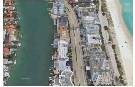
Built in 1968 - 130 units - 17 floors

Royal Embassy Condominium Association 5750 Collins Ave Apt 3B Miami Beach, FL 33140 Phone: +1 305-868-3488