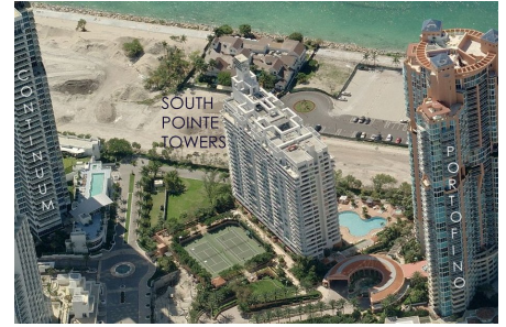
Built in 1987 - 205 units - 24 floors

South Point Condominium Assn (305) 538-8930