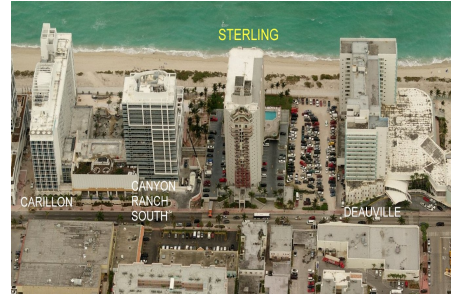
Built in 1991 - 184 units - 21 floors