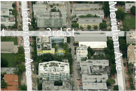
Built in 2003 - 19 units - 5 floors

Sundance Lofts Miami Beach Condo Association Management Office 828 3 St Miami Beach, FL 33139