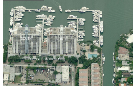
Built in 1998 - 210 units - 26 floors

Sunset Harbour South Condominium Association, Inc. 305-538-6849