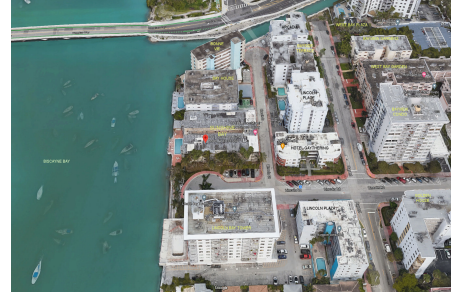
Built in 1963 - 48 units - 4 floors

SUNSHINE BAY CONDOMINIUM ASSOCIATION, INC. 1441 Lincoln Court Suite 500 Miami Beach, FL 33139