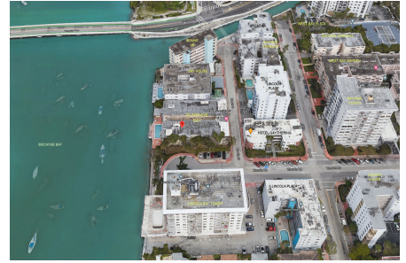
Built in 1963 - 48 units - 4 floors

SUNSHINE BAY CONDOMINIUM ASSOCIATION, INC. 1441 Lincoln Court Suite 500 Miami Beach, FL 33139