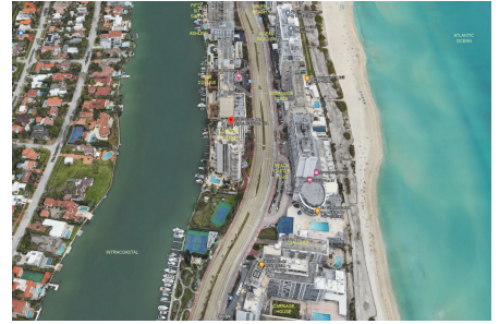
Built in 1974 - 83 units - 25 floors

Towerhouse Condominium Address: 5500 Collins Ave, Miami Beach, FL 33140, Phone: +1 305-865-8677