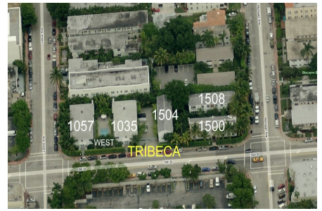
Built in 1972 - 24 units - 2 floors

Tribeca Condominium 1500 Michigan Ave: (305) 674-0536 1504 Michigan Ave: (305) 534-4984 1508 Michigan Ave: (305) 674-6873 1035 15 St: (786) 276-1739 1057 15 St: (305) 695-2815