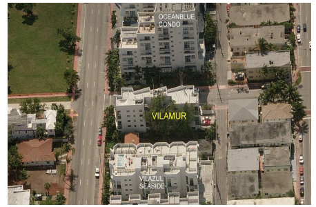
Built in 2004 - 10 units - 5 floors