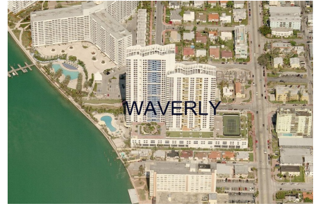
Built in 2003 - 400 units - 35 floors

Waverly South Beach Condo concierge: (305) 674-3255