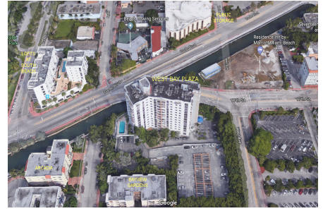
Built in 1995 - 112 units - 13 floors

West Bay Plaza Condominium Association Inc 1688 West Avenue # 807 Miami Beach, FL 33139 Phone: (305) 534-0017 (305) 534-0099