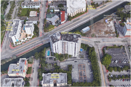
Built in 1995 - 112 units - 13 floors

West Bay Plaza Condominium Association Inc 1688 West Avenue # 807 Miami Beach, FL 33139 Phone: (305) 534-0017 (305) 534-0099