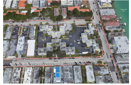
Built in 1949 - 60 units - 2 floors