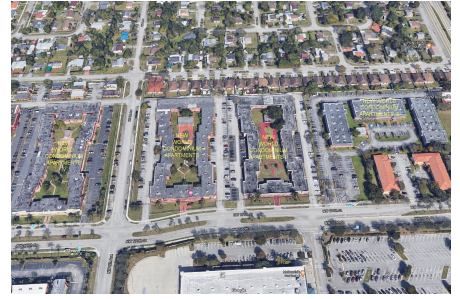
Built in 1968 - 75 units - 2 floors

New World Condominium III Address: 271 NW 177th St, Miami, FL 33169 Phone: +1 305-999-9700