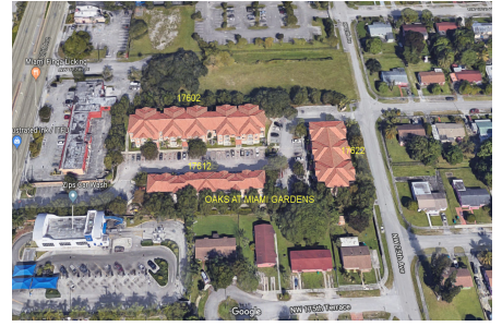
Built in 2006 - 60 units - 3 floors

The Oaks At Miami Gardens Condominium Association Inc 5801 NW 151st Street # 203 Miami Lakes, FL 33014 Phone: (305) 598-4068