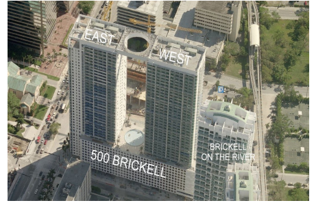
Built in 2008 - 320 units (633 units with West Tower) - 42 floors

http://atlanticandpacific.net/500brickell/outside_home.asp