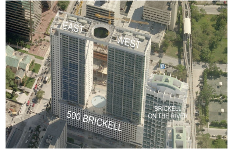
Built in 2008 - 313 units (633 units) with East Tower) - 43 floors

Atlantic and Pacific Management 305 867 2245 & 786-270-2502 http://atlanticandpacific.net/500brickell/outside_home.asp