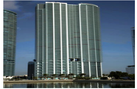
Built in 2008 - 516 units - 63 floors

900 Biscayne Bay Condominium Association, Inc 786-206-6781