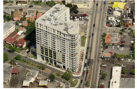
Built in 2007 - 129 units - 16 floors

Altos de Miami Condo Association 305-631-8227