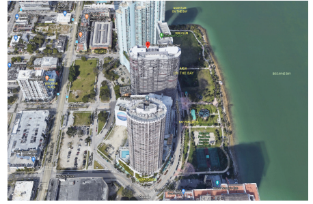
Built in 2018 - 648 units - 52 floors

Aria on the Bay Condominium Association, INC Address: 488 NE 18th St, Miami, FL 33132 Phone: +1 786-753-5611 https://ariaonthebay.com