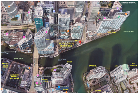
Built in 2024 - 386 units - 63 floors