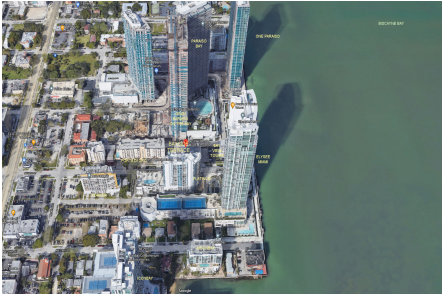
Built in 1970 - 36 units - 7 floors