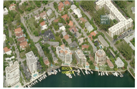
Built in 2004 - 10 units - 5 floors

Number of units: 10 Number of active listings for rent: 0 Number of active listings for sale: 1 Building inventory for sale: 10% Number of sales over the last 12 months: 1 Number of sales over the last 6 months: 1 Number of sales over the last 3 months: 1