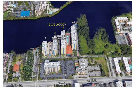
Built in 2003 - 195 units - 17 floors

Blue Lagoon Condominium Association, Inc. 5077 NW 7 Street Miami, Florida 33126 Phone:(305) 442-1494 Fax:(305) 442-1491 http://www.bluelagooncondominiums.com/