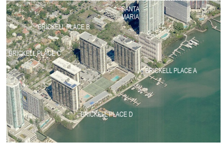
Built in 1980 - 228 units (939 in total with A,B and C) - 23 floors

Brickell Place Phase Two Association (305) 858-3891