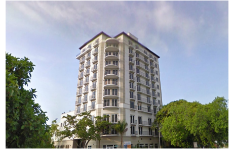
Built in 2009 - 51 units - 11 floors

Brickell Way Condominium Association Inc (305) 250-4195