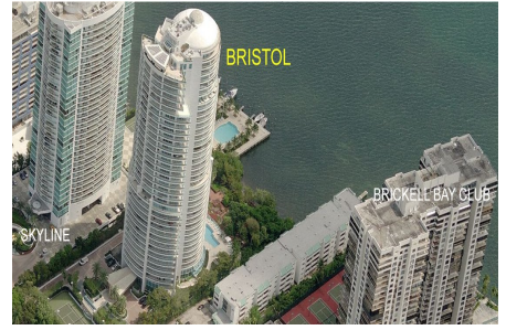
Built in 1993 - 146 units - 39 floors

Bristol Tower Condominium Association (305) 856-2200 & (305) 856-7670