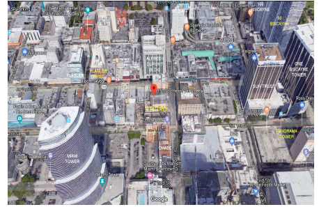
Built in 2016 - 352 units - 36 floors