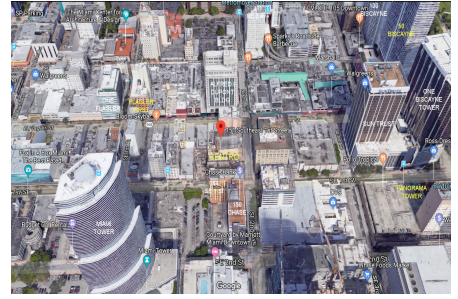
Built in 2016 - 352 units - 36 floors