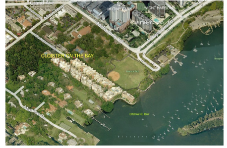
Built in 2006 - 40 units - 3 floors

Cloisters On The Bay Guard 3471 Main Hwy, Miami, FL 33133 (305) 445-0990