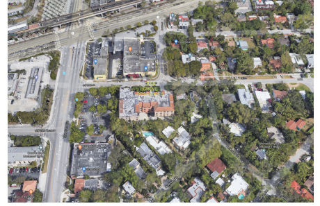
Built in 2004 - 62 units - 4 floors