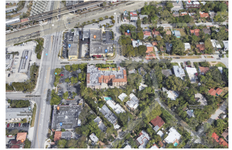
Built in 2004 - 62 units - 4 floors