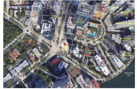
Built in 2007 - 170 units - 57 floors

ECHO BRICKELL ADDRESS 1441 BRICKELL AVE STE. 1510, MIAMI, FL 33131 PHONE 786 360 1904 http://www.echobrickell.com/contact/