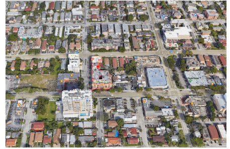
Built in 1987 - 82 units - 4 floors