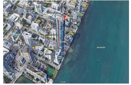
Built in 2021 - 94 units - 58 floors

Number of units: 94 Number of active listings for rent: 1 Number of active listings for sale: 16 Building inventory for sale: 17% Number of sales over the last 12 months: 5 Number of sales over the last 6 months: 1 Number of sales over the last 3 months: 1 Elysee Miami Address: 788 NE 23rd St, Miami, FL 33137 Phone: +1 305-435-9733