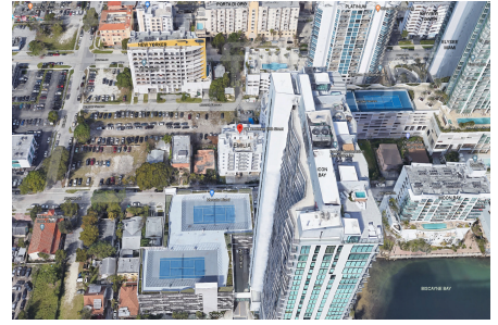
Built in 2018 - 30 units - 7 floors