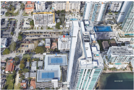
Built in 2018 - 30 units - 7 floors