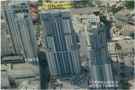
Built in 2008 - 442 units (870 units in total) - 49 floors