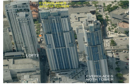
Built in 2008 - 442 units (870 units in total) - 49 floors