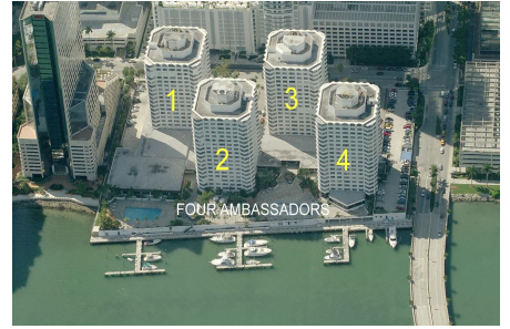
Built in 2007 - 182 units (726 in Complex) - 19 floors