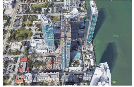
Built in 2019 - 313 units - 54 floors

Gran Paraiso Residences Address: 480 NE 31st St, Miami, FL 33137 Phone: +1 786-351-3342