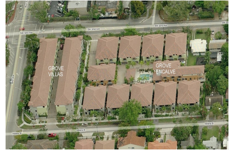
Built in 2006 - 22 units - 2 floors

Grove Enclave Condominium Association, Inc 5805 Blue Lagoon Drive # 310 Miami, FL33126-2053 (786) 319-5233