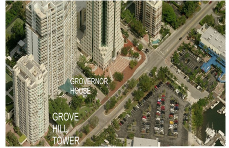
Built in 1996 - 75 units - 21 floors

Grove Hill Condominium Association Inc (305) 854-3177