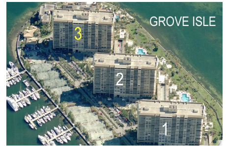
Built in 1981 - 165 units - 18 floors

Grove Isle Condominium Association (305) 856-4070