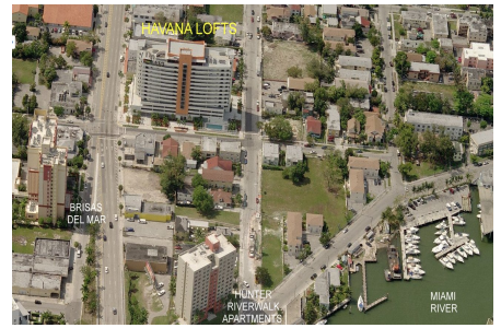
Built in 2007 - 90 units - 13 floors