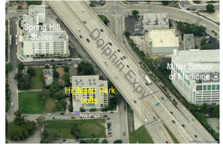
Built in 2007 - 48 units - 7 floors

Number of units: 48 Number of active listings for rent: 3 Number of active listings for sale: 0 Building inventory for sale: Number of sales over the last 12 months: 0% Number of sales over the last 6 months: 0 Number of sales over the last 3 months: 0 Highland Park Lofts Condominium Association, Inc 1350 NW 8th Ct, Miami, FL 33136 (305) 326-9189