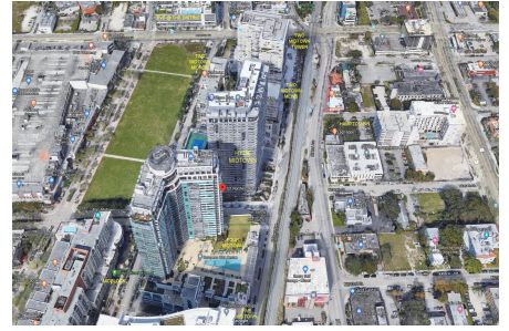
Built in 2013 - 410 units - 38 floors

Hyde Midtown Condominium Address: 121 NE 34th St, Miami, FL 33137 Phone: +1 786-292-4919